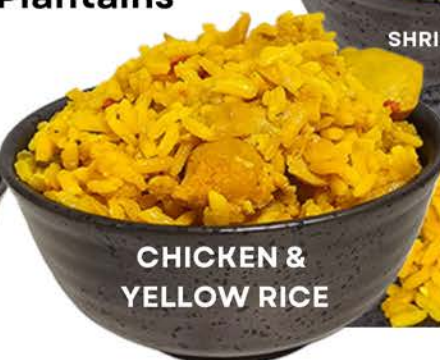
CHICKEN & YELLOW RICE