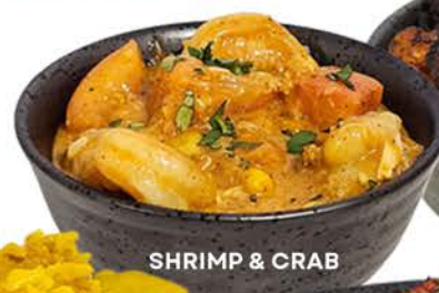
SHRIMP & CRAB