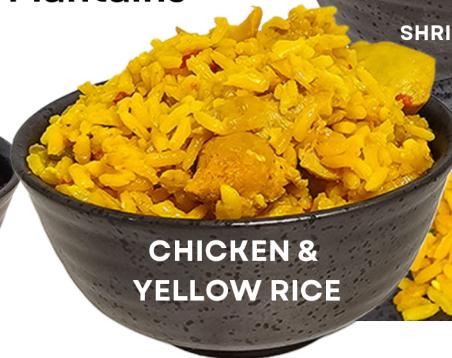
CHICKEN & YELLOW RICE