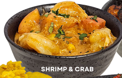
SHRIMP & CRAB